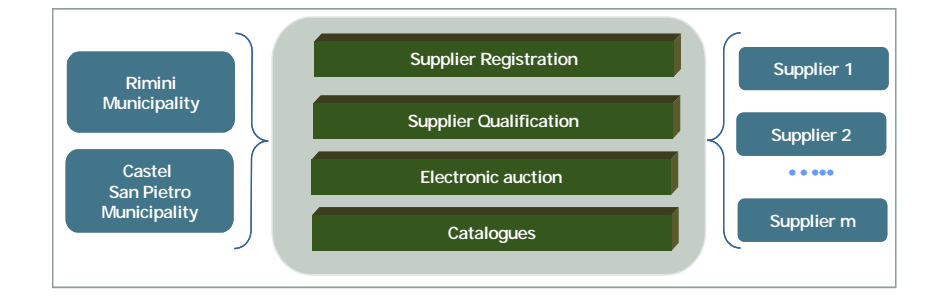
FIGURE 2 e-Procurement platform functional architecture