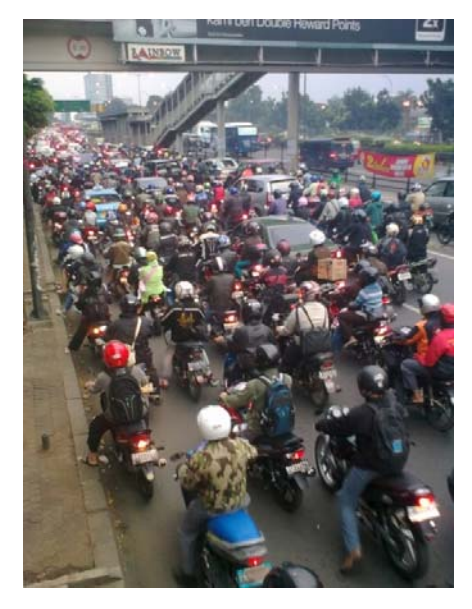
Pic 1. Jakarta every morning

Based on this illustration, people took their own decisions which not necessarily follow the common sense. Transparency, accountability and fairness can be perceived differently as well from the common sense. People have different perspective of understanding a subject. Thus, they execute every subject differently and can end up with a different understanding.