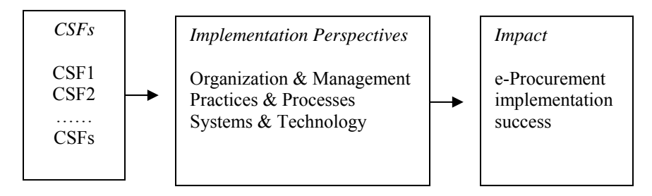
FIGURE 1 Conceptual framework

e-Procurement report (IBM, 2003) has identified the three areas where e-Procurement implementation strategy should be focused to ensure that the required practices, processes, and systems are developed and rolled out in a consistent manner across the public sector. As such, the three areas - organization and management, practices and processes, and systems and technology - have been termed as "implementation perspectives" for the purpose of this study. Each of these perspectives highlights important aspects of the e-Procurement implementation process. The overall conceptual model for this study presented below (Figure 1), emphasizes the interplay between the three perspectives and will serve as the basis for the development of the propositions about the impact of CSFs in implementation perspectives and on the success of an e-Procurement initiative.